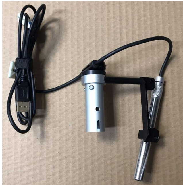
CAM-SET (Camera and Camera mounting Hardware)

Tablet with Windows 8 or 10 or Laptop with Windows 8 or 10