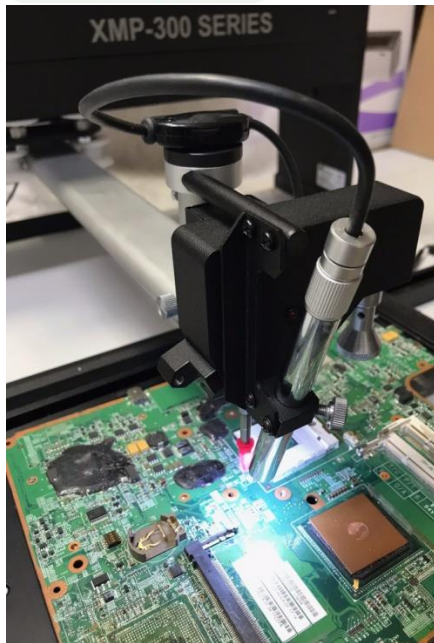
View of the small SMD elements on a PCB on the 9" Tablet